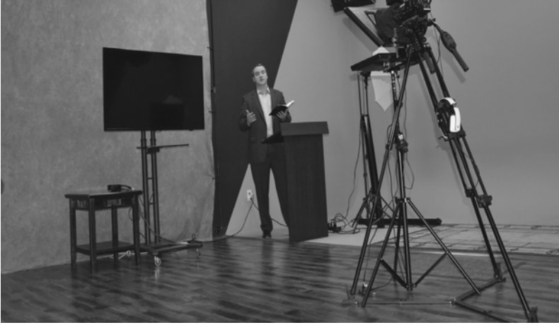
Luther Rice is committed to pursuing technological innovation in all aspects of the Institution. Online courses contain video lectures created by Luther Rice professors in our custom video studio on-campus.