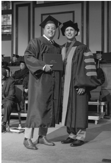
A graduate receiving his diploma during commencement ceremonies, held annually at First Baptist Church, Conyers, Georgia.

These Master of Arts programs are limited in their development of students preparing for ministry as a pastor. Pastoral candidates are encouraged to enroll in the Master of Divinity program. Those who are considering pastoral ministry may benefit from earning one of these specialized degrees prior to entry into the M.Div. Transfer of the credits is possible, subject to the limitations for the program of study. The Master of Divinity degree is designed to provide a broad base of knowledge to fit the needs of students preparing for a lifetime of ministry. The M.Div. may be earned entirely online or by a combination of both online and on-campus classes.