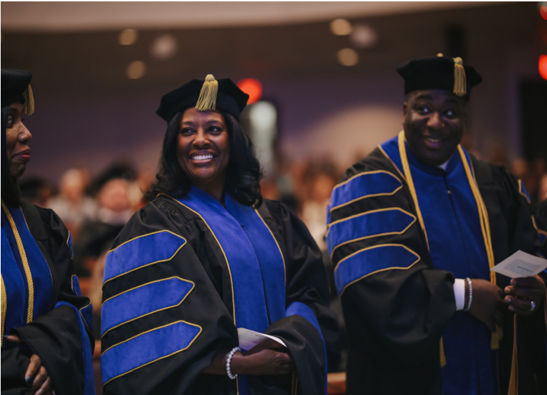
The first class of Ph.D. in Organizational Leadership students at Luther Rice graduated in May 2025.