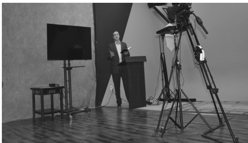
Luther Rice is committed to pursuing technological innovation in all aspects of the Institution. Online courses contain video lectures created by Luther Rice professors in our custom video studio on-campus.