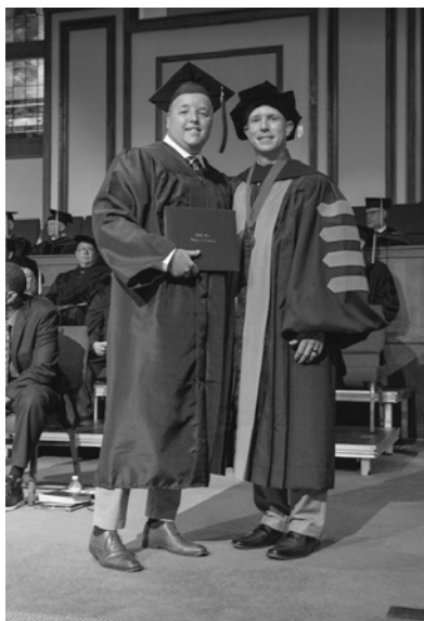
A graduate receiving his diploma during commencement ceremonies, held annually at First Baptist Church, Conyers, Georgia.

These Master of Arts programs are limited in their development of students preparing for ministry as a pastor. Pastoral candidates are encouraged to enroll in the Master of Divinity program. Those who are considering pastoral ministry may benefit from earning one of these specialized degrees prior to entry into the M.Div. Transfer of the credits is possible, subject to the limitations for the program of study. The Master of Divinity degree is designed to provide a broad base of knowledge to fit the needs of students preparing for a lifetime of ministry. The M.Div. may be earned entirely online or by a combination of both online and on-campus classes.