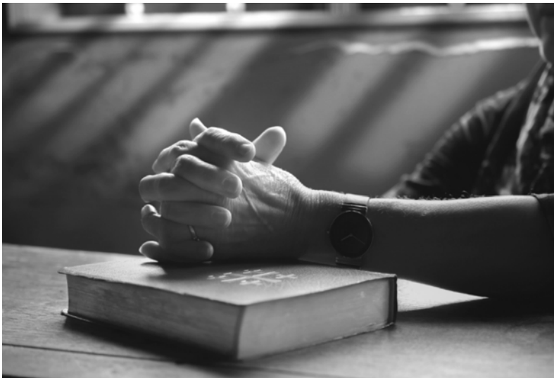
Luther Rice is committed to the inspired, inerrant, and authoritative Word of God - and that's what we teach.