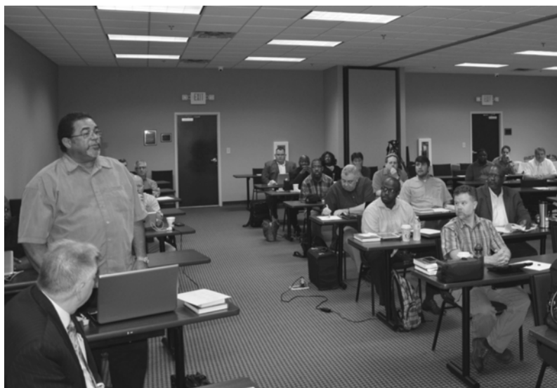
Doctor of Ministry module class meeting on campus in Woodlawn Hall.